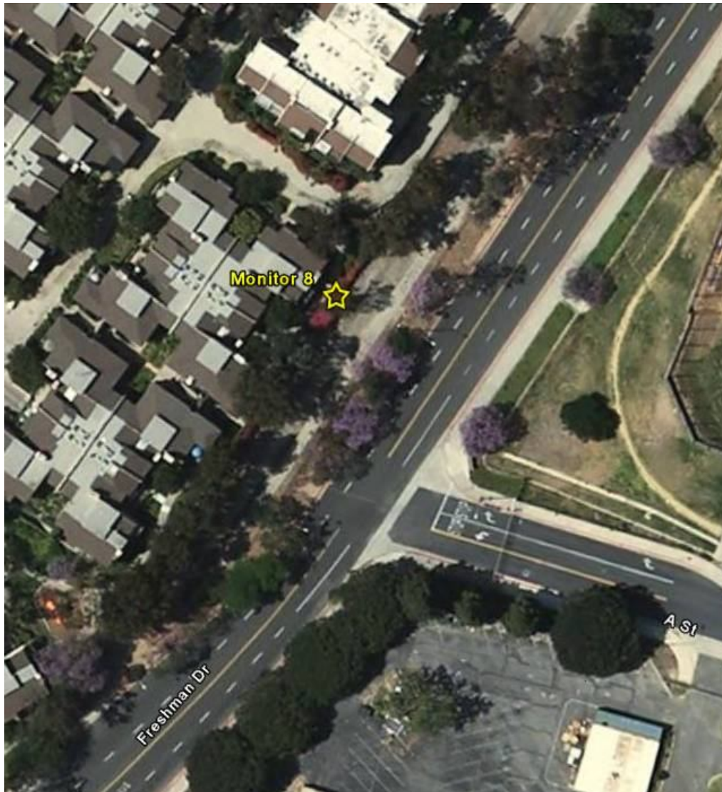
Figure 2: Noise Monitor Location

Monitor 8 is located near Building 15 in the south end of the Lakeside Villas complex, directly next to the property wall that separates the Building 15 pathway from the LADWP spillway. Prior to construction activity, the primary noise sources in this area were residential activity, landscaping equipment and lawnmowers, airplanes, athletic activity on the baseball field, and traffic noise from Freshman Drive and A Street.